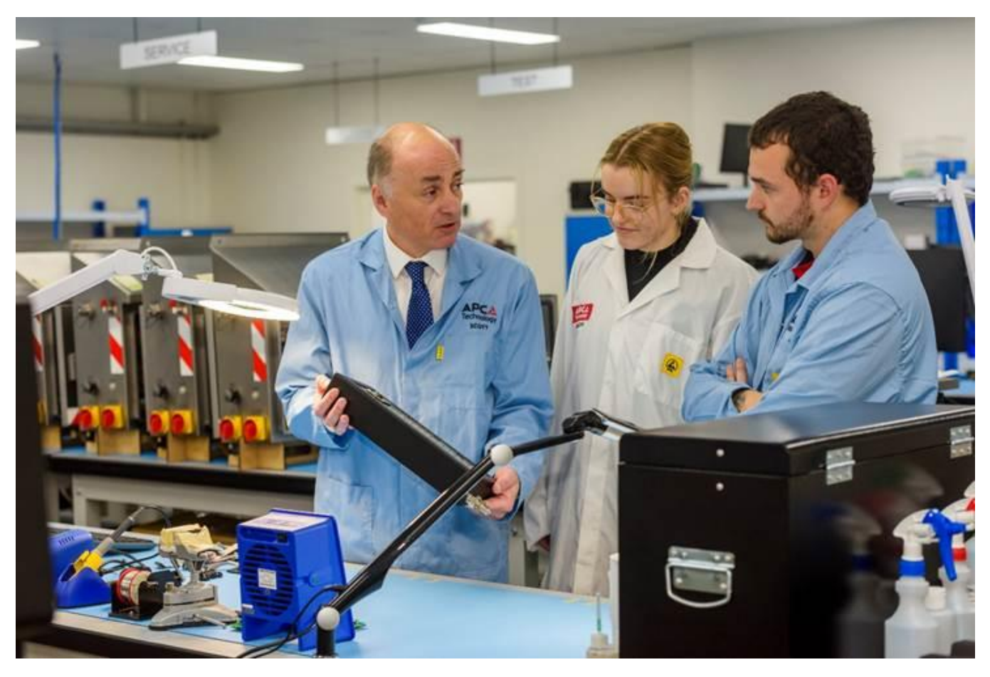
APC Technology with work-integrated learning students in South Australia